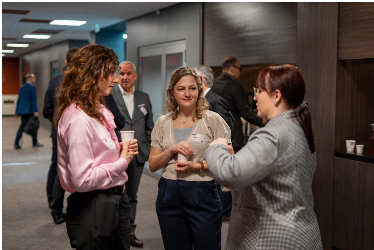
Figure 10. Participants discussing in the catering hall

Side moments have also given the opportunity to interview participants and ask for pieces of feedback regarding their project, the SecurIT initiative overall and its meaning to their development strategy. Those interviews have been recorded and are available on the SecurIT Final Event video.