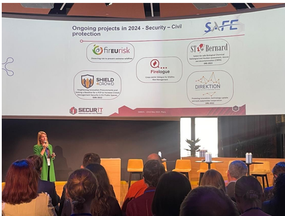
Figure 14. Presentation of SecurIT project in SMI2G

New relevant contacts were made not only to SecurIT partners but also to SecurIT sub-grantees, enhancing their network and potential collaborations in the near future. Among others, representatives from the EENA (European Emergency Number Association) and the French Police R&D center came to our booth to ask for questions and represented great prospects for either R&D or business collaborations with SecurIT sub-grantees.