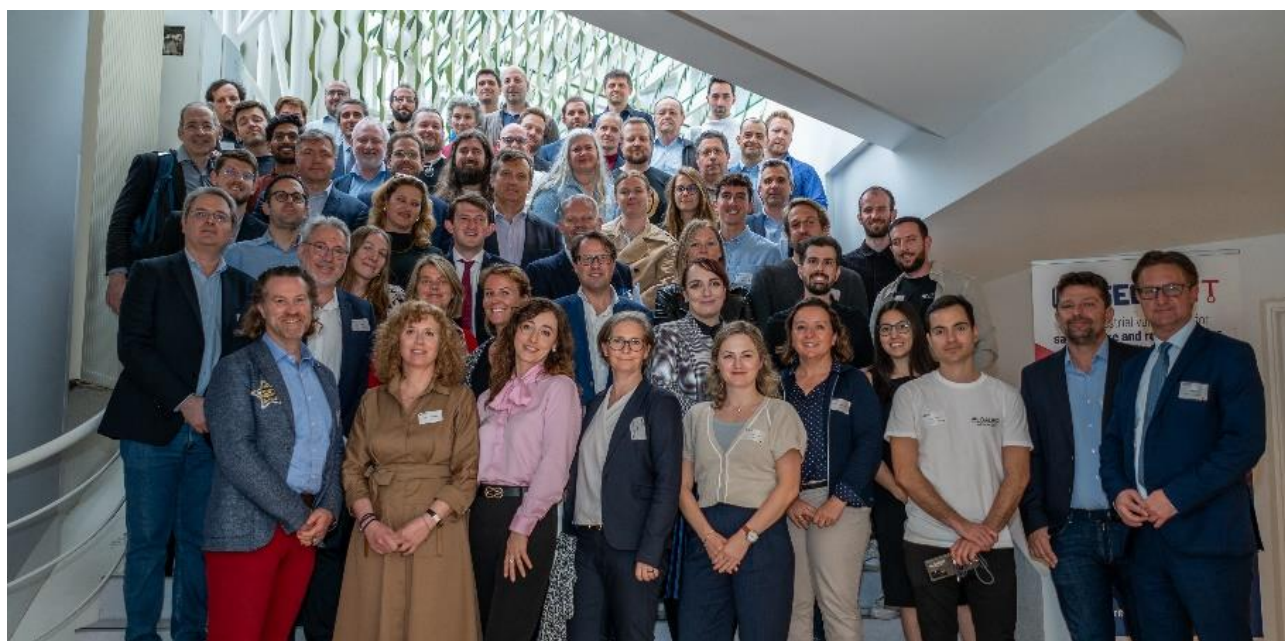
Figure 15. Group picture to close a very insightful event

As a general feedback, people attending the event really enjoyed taking part to it. The fact that most of the sessions were open to questions was really appreciated and make everyone feel included in the conversations. The SecurIT awards ceremony has also been seen as the best way to congratulate everyone for their participation in such an initiative. Even though the topic of security research and innovation is really a touchy and specific area, project partners successfully organized and carried out activities throughout the day making it a great achievement.