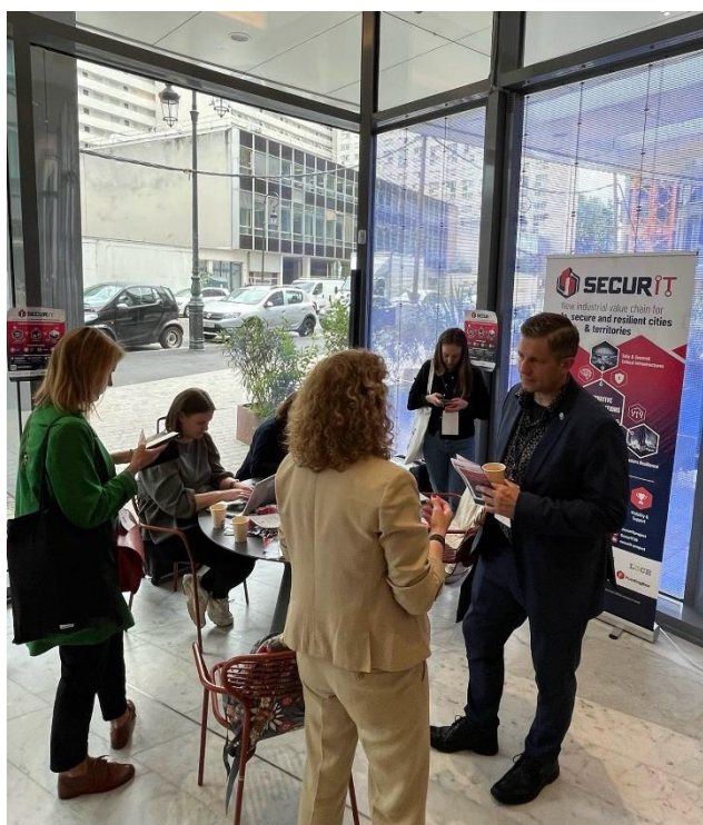
Figure 13. SecurIT booth at SMI2G 2024