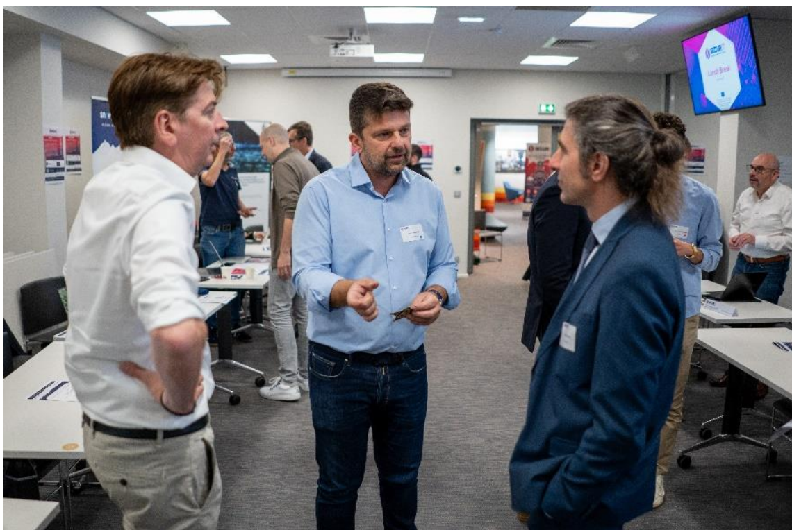
Figure 9. Exchanges between Open Call selected SMEs around the 15 booths

A “showcase village” has been built aside the conference room. A total of 15 booths have been set up and gave the opportunity to funded SMEs to present their solution and sometimes demonstrate it.