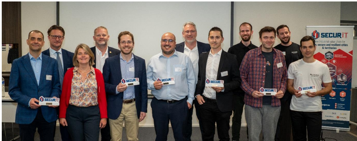
Figure 12. Winners of the SecurIT awards