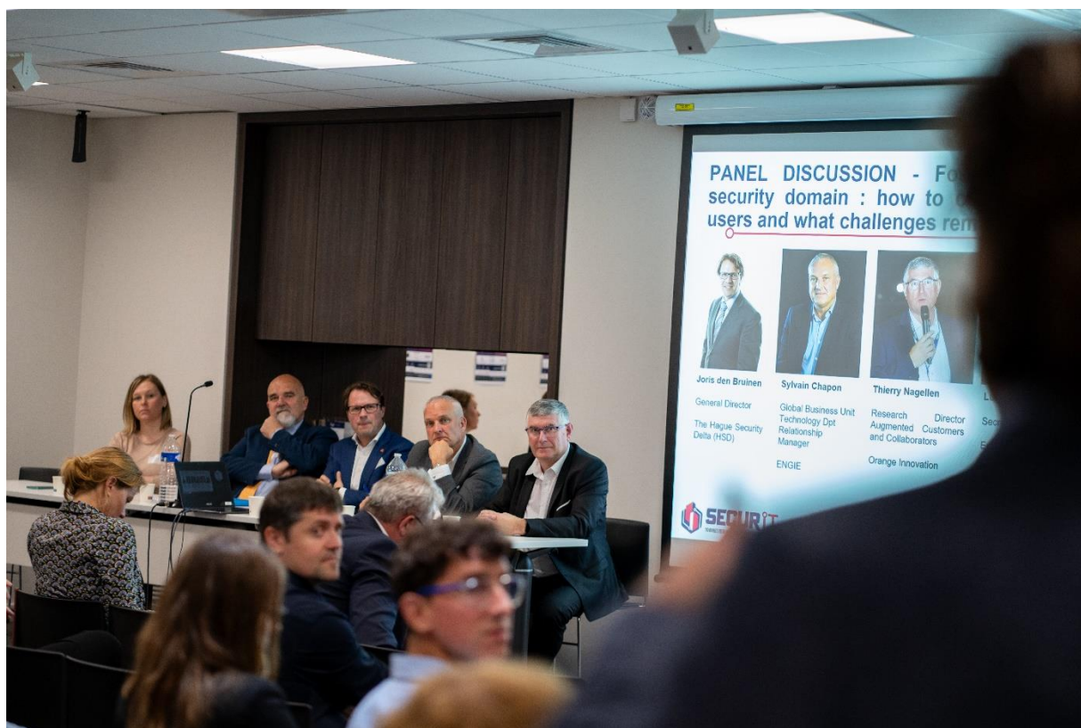
Figure 8. Participant asking a question to the panelists