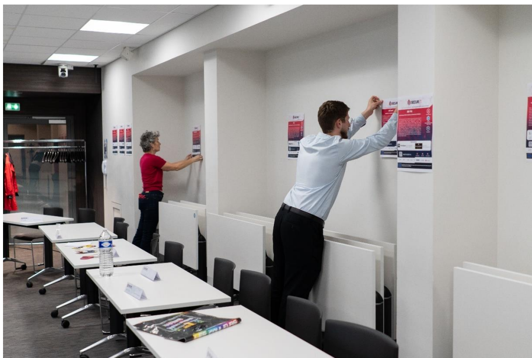
Figure 16. Room preparation

The room was branded with the colors of the SecurIT project: roll up banners were placed in front of the door and at the room's corners, flyers and brochures were available at the registration table and agendas were put all over the 87 chairs facing the conference section. The brochures were specifically designed to this event and for dissemination purposes during the SMI2G conference, describing in a few lines the 42 funded projects and redirecting the readers to the websites throughout the scanning of dedicated QR codes. Each of the 42 SecurIT sub-granted projects had their poster on the walls allowing participants to have an idea of the funded initiatives and the SMEs involved. The booth section was also welcoming 15 projects selected on a voluntary basis and exhibitors could share direct insights and make new connexions on-site. A lot of efforts had been put on the d-day morning to make participants feel that they belonged to the initiative and that they were not only spectating, especially throughout the room's decoration and shape.